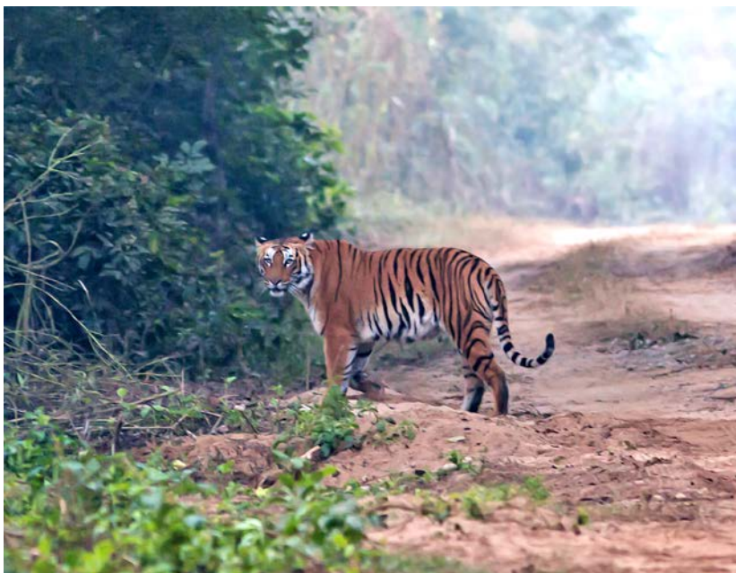
John Anderson ( http://www.pbase.com )

Nov 28 A Tiger (female) crossed the trail in front of the jeep, an impressive sight. Birds included a Himalayan Flameback, two perched Cinereous Vultures, and our first (male) Kaleej Pheasant. Returned to the lodge at 11.30, where we saw Mountain Hawk-Eagle and Collared Falconet. Lunch at 13.00, and then dipped on a Brown Fish-Owl. Best bird of the day was a Hobby, together with two Red-headed Vultures, near the lodge.