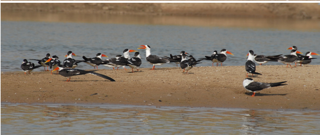
Black-bellied Tern (top) and Indian skimmer (bottom, also top next page).