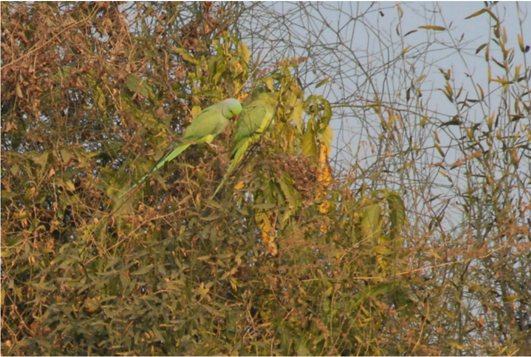
Rose-ringed (Ring-necked) Parakeet