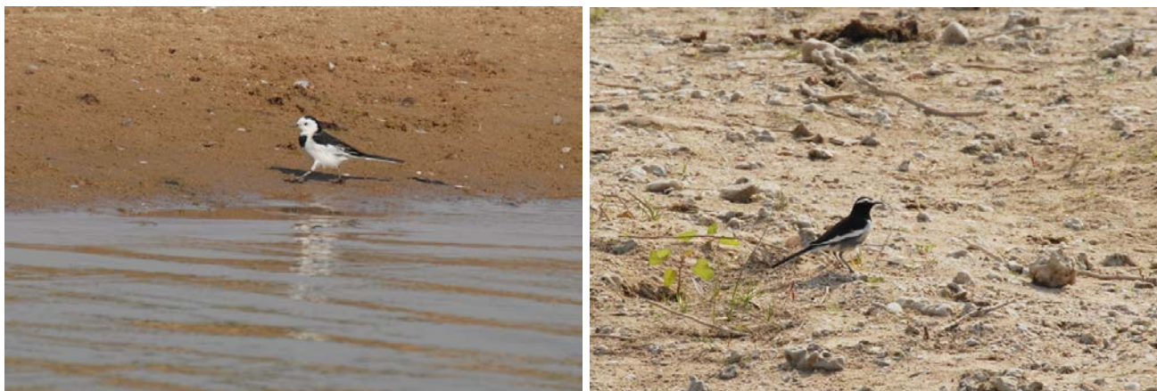
Amur Wagtail (left) and White-browed Wagtail (right).

Amur Wagtail Motacilla (alba) leucopsis – Seen on two days, best seen at the Chambal River together with Indian Skimmer, Black-bellied tern, and Black-winged Stilt. Four strikingly black-and-white species.